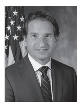
Congressional District 3