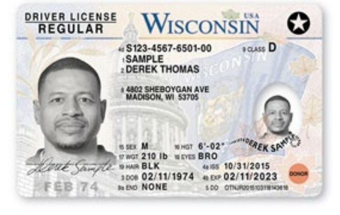
Figure 2: Samples of Student Fee Statement & Out of State Driver's License for Exercise