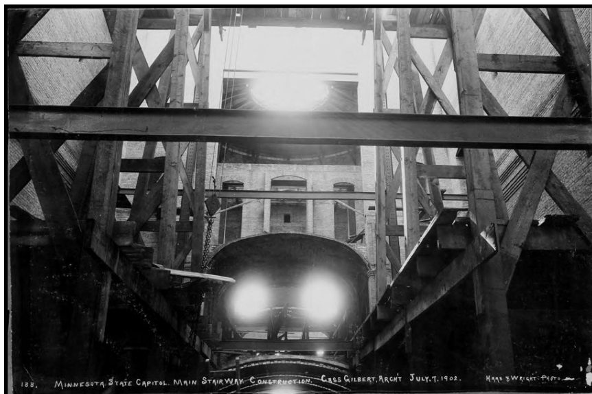
Construction on the Minnesota State Capitol’s main stairway on July 7, 1902. The use of steel framing for constructing buildings was still relatively new, as America’s first steel-framed skyscraper (10 stories) had been built not seven years earlier, in Chicago, IL.