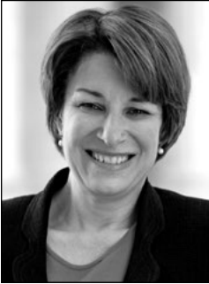
Amy Klobuchar (Democratic-Farmer-Labor)

The U.S. Constitution provides: To qualify as senator, a person must be 30 years old, a citizen of the United States nine years, a resident of the state, and elected by the people.