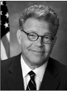
Al Franken (Democratic-Farmer-Labor)

Olcott Plaza, Room 105 820 Ninth St. N. Virginia, MN 55792 Phone: (218) 741-9690 Fax: (218) 741-3692