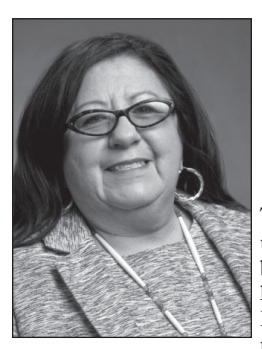
Mille Lacs Band of Ojibwe

A major bingo facility, Jackpot Junction opened in 1984. Building on this, it was expanded to a casino on the signing of the State compact in 1989. The Tribe then went to court to force another state compact allowing blackjack. A service station and convenience store built in 1991 are adjacent to the casino as well as a nearby motel, hotel, and convention center.